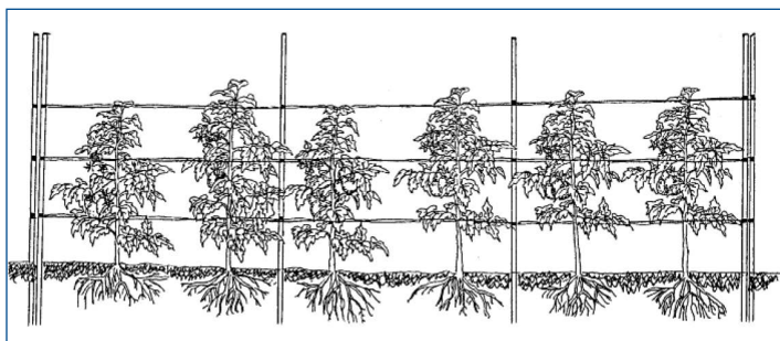
Basket weave system.

The basket weave (sometimes called 'Florida weave') system uses about half as many stakes as individual staking, and also saves labor. This system is best suited to determinate varieties of tomatoes, but can be used for indeterminate varieties if the tops are trimmed once they reach the top of the stakes.