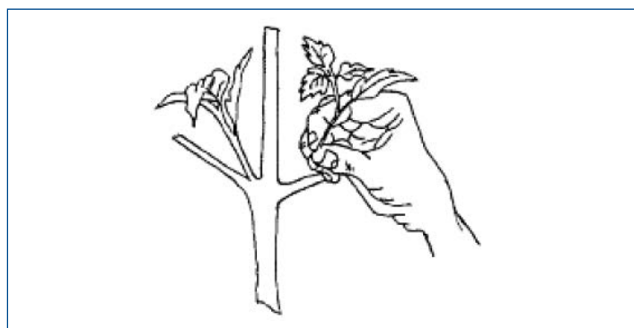
Removing a sucker.